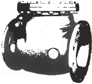
FIG. 126 FLANGED ENDS, BRONZE FACED

The Clow is a clear opening valve, with standardized and completely interchangeable parts and is listed by both Underwriter's and Factory Mutual.